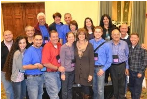
Some of our staff at the Navigators National Conference in Louisville this month

I'd love to have you join us to hear her speak at Embassy Suites Hotel on Monday, December 12th. Email me at kwarin@navigatorsabq.org if you'd like to attend and I'll reserve a spot for you!