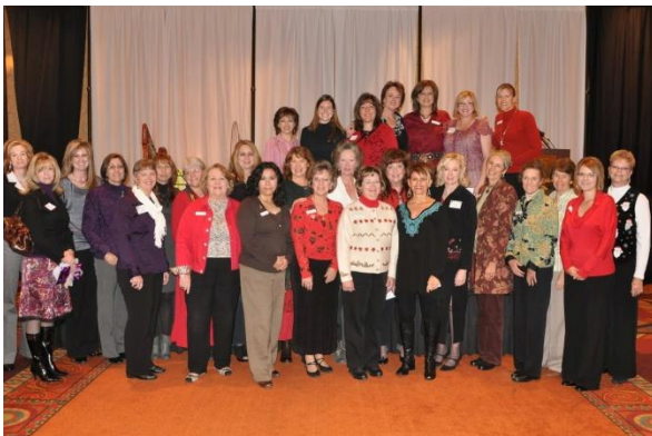
Our wonderful table hostesses, Christmas 2009

Our speaker this year is a woman from Dallas, Texas who will share how she and her husband learned to keep their faith in God after losing their young son to cancer. It's a message on how to journey well and trust God even when His answer to our prayers is no. If you've never been to one of these luncheons before, this would be a great one to try. Email me at kwarin@navigatorsabq.org for more information.