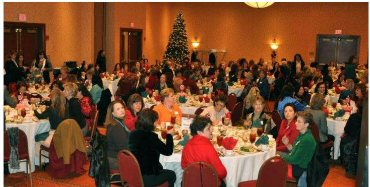
Last year's Christmas luncheon attended by over 250 women