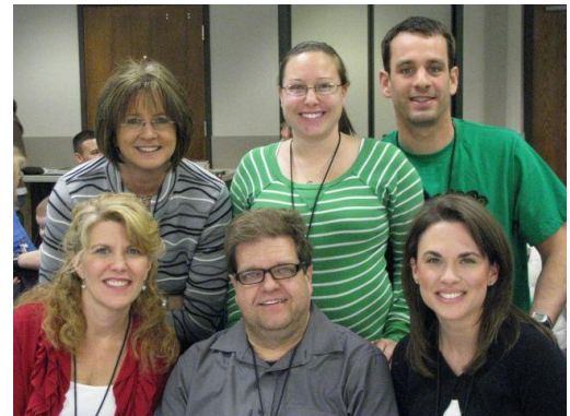
My "coachees" at the Nav Funding School

Earlier this year I traveled to Colorado Springs to serve as one of the funding coaches for The Navigators' new-staff training program. I met some great people from around the country. I was able to encourage them as they learned how to share their stories with potential donors and raise support.